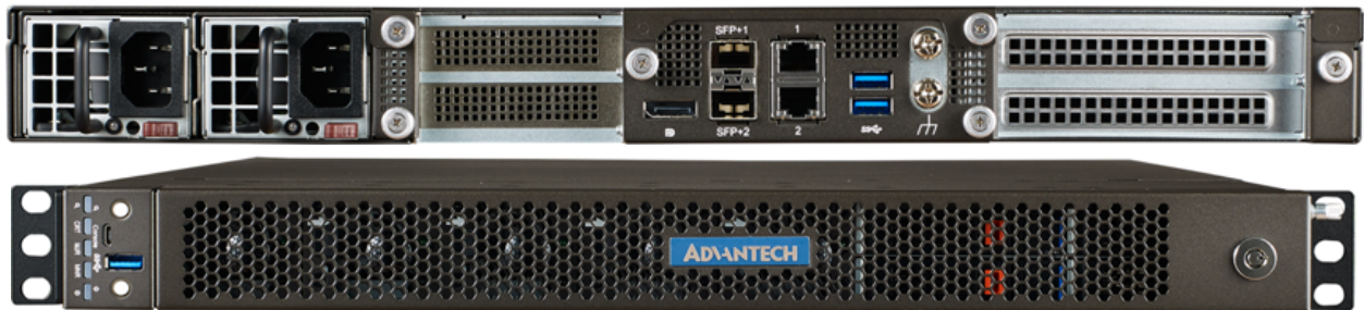
Figure 3. Front and back views of the Advantech SKY-8101 server. 2

The primary model for vBRAS applications is the SKY-8101, a 1RU, single-socket server that can scale to 28 cores and supports configurations across the entire range of Intel Xeon Scalable processors. The server supports six DIMM sockets to enable high capacity six-channel configurations providing fast memory access. The SKY-8101 PCIe subsystem offers abundant I/O expansion with slots for three PCIe x8 Gen3 adapters—two full height, full length and one low profile—in addition to onboard NICs and one further PCIe x4 Gen3 slot for Advantech personalization cards.